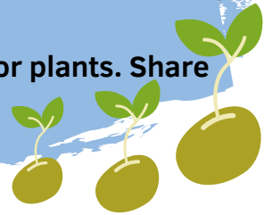
Coco de mer

As a symbol of hope, spend some time planting some new seeds or plants. Share photographs of what you have grown on our social media.