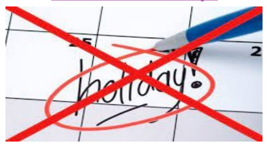
There are 175 non-school days a year to enjoy.